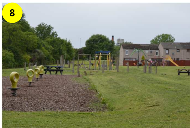
The children's Adventure Trail – and possibly the location of the proposed Pensioners Playground