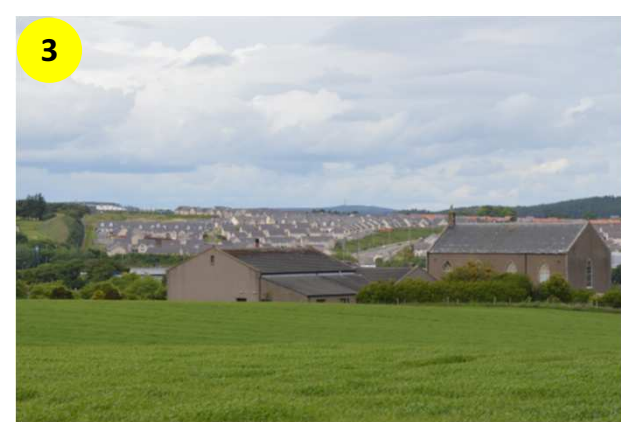
Above Portlethen Woodland: views northwards past the Church and Hillside School to Brimmond Hill (near Aberdeen Airport)