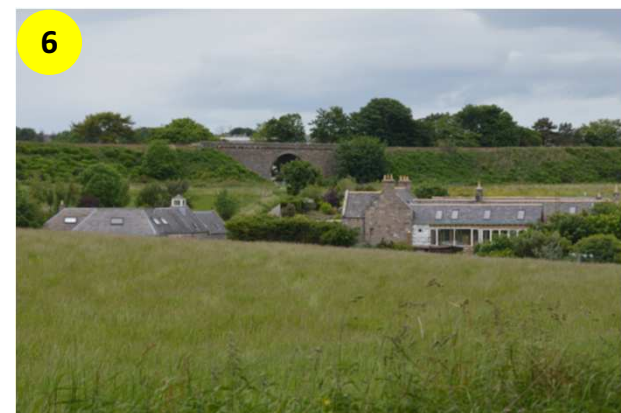
Looking towards Mill of Findon and the railway line