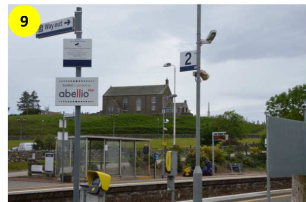
Portlethen Parish Church seen from the railway station