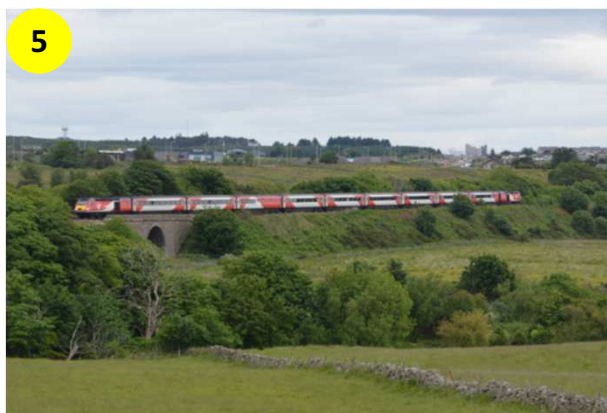
Virgin Trains East Coast, an old 125 heading from Aberdeen to London King's Cross