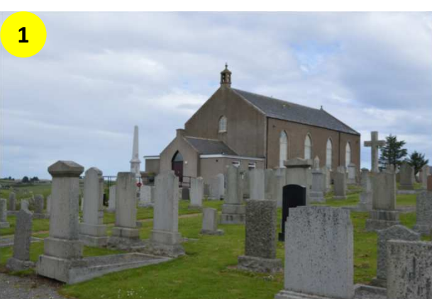
Start: Portlethen Parish Church