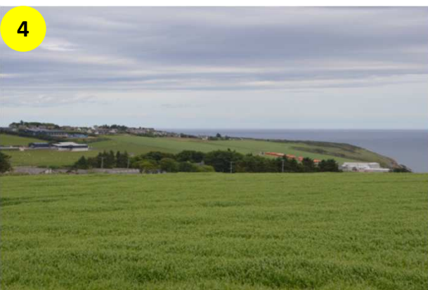
Above Portlethen Woodland: view north-east towards Findon and Findon Moor