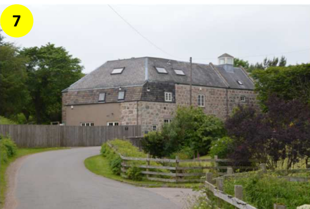
Mill of Findon – at the mill pond there can occasionally be seen a couple of Herons and, now and then, a deer