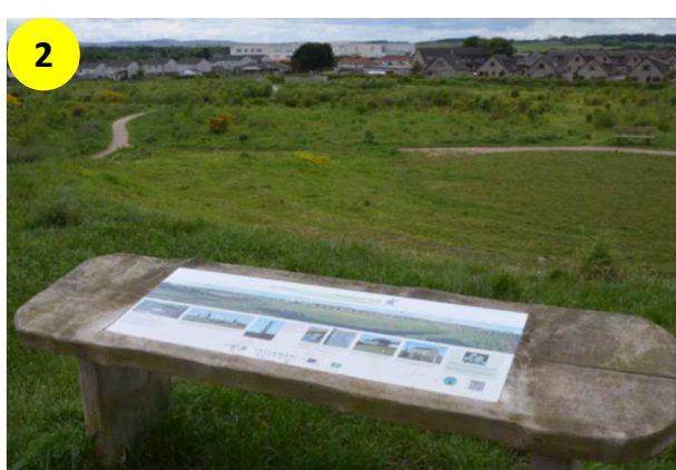
Portlethen Woodland: views westwards to the Academy, Boswell's Monument, Durris Transmitter, Meikle Carewe wind farm etc.