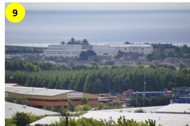
9 Portlethen Academy and in the foreground, Badentoy Park