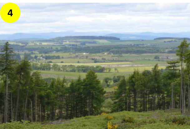
4 Looking west, up Deeside. With good visibility it is possible to see Lochnagar – especially when there is some snow cover on it's summit