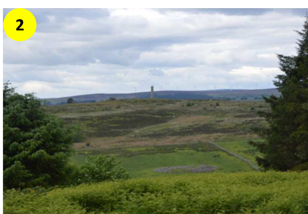
2 Boswell's Monument and Meikle Carewe wind farm etc.