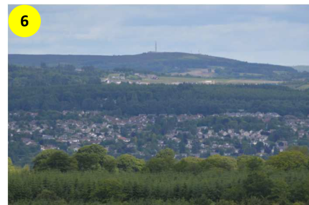
6 From the top – Brimmond Hill, with Cults in the foreground