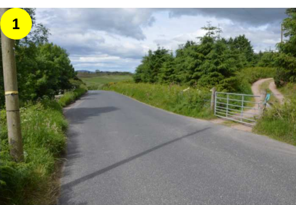
1 Start: tight space for one or two cars to the left, then lowp over the gate and up the track