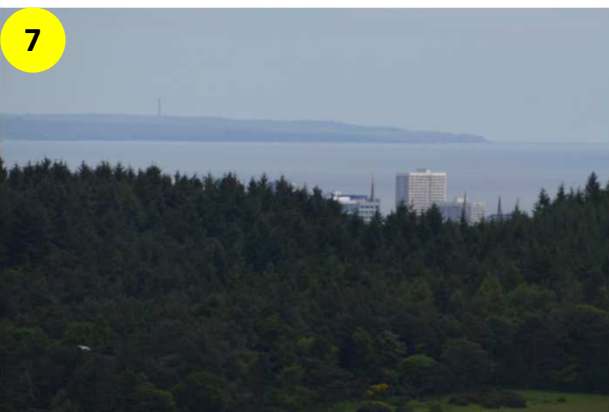
7 From the top – view past Aberdeen to Buchan Ness and Peterhead Power Station (the chimney to the left of the picture)