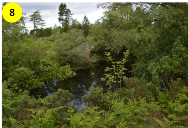
8 Just down from the top – a small granite quarry, now filled with water (and frogs etc.)