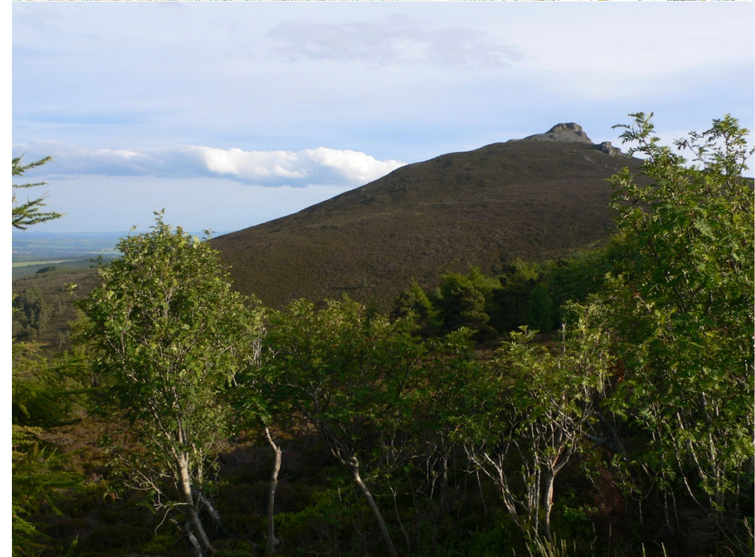
A glorious evening for a walk!