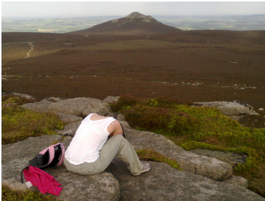
At the top of the second peak; Oxen Craig – will this walk (or should that be purgatory) ever end?