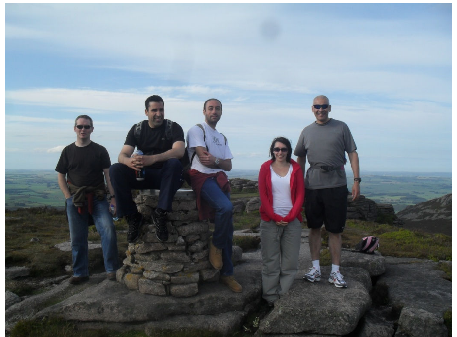
Cool dudes !