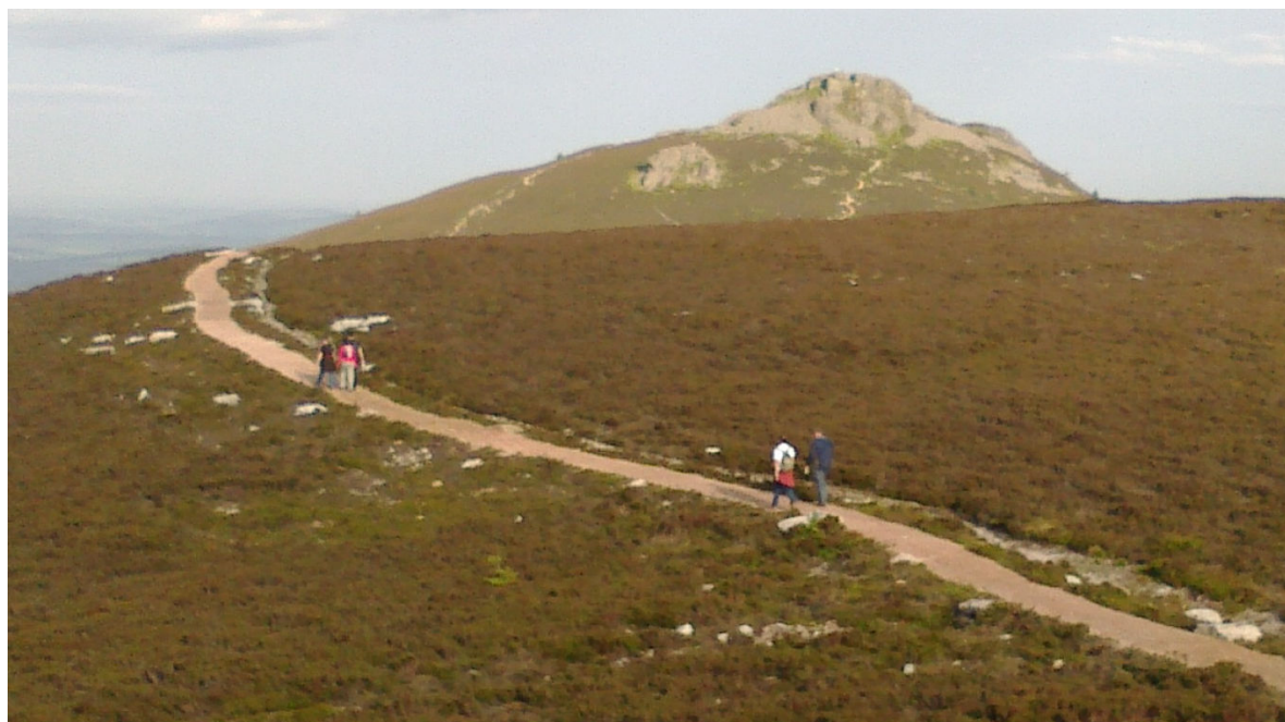
Guys – wait up – I promise to never suggest heading to Bennachie ever again!

14 th June 2011; Leave work 4:00pm Start walking 4:45pm Top of Mither Tap 5:45pm Top of Oxen Craig 6:30pm Top of Craigshannoch 7:00pm Finish walking 7:45pm Back home 8:30pm