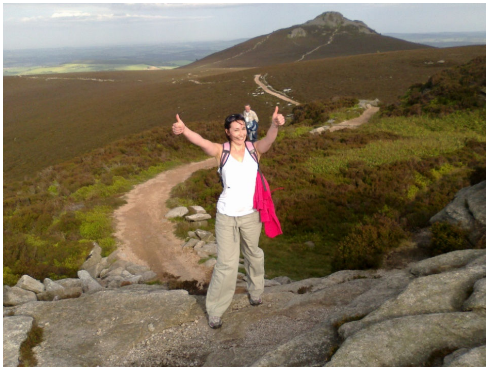
Yeehaa – the third (and final) peak; Craigshannoch