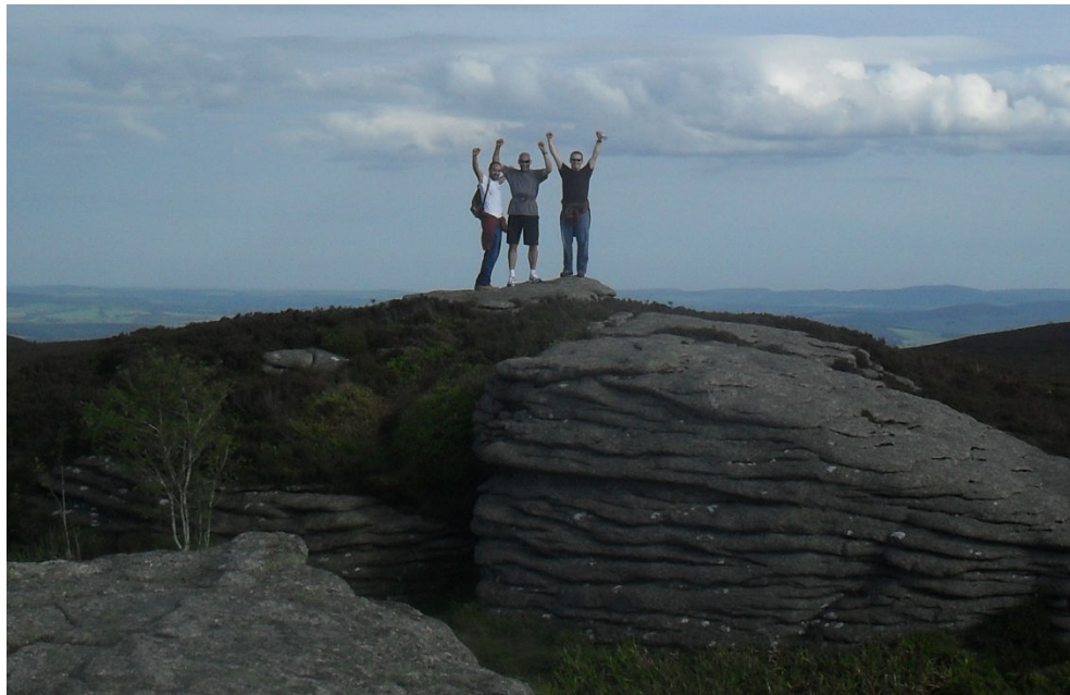
Who are those crazy fools ?